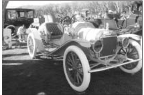
ABOVE: The 1911 Ford (Idea drawn by Edsel Ford in 1910) BELOW: 1914 Stellite