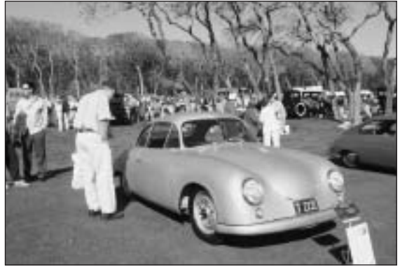
Jerry Seinfeld's 1949 Porsche

£150 (about $420 back then...) and the carpenter would build a new chicken coop. All that was left was the $79 freight bill to the U.S. and 30 years of love, care and restoration bills.