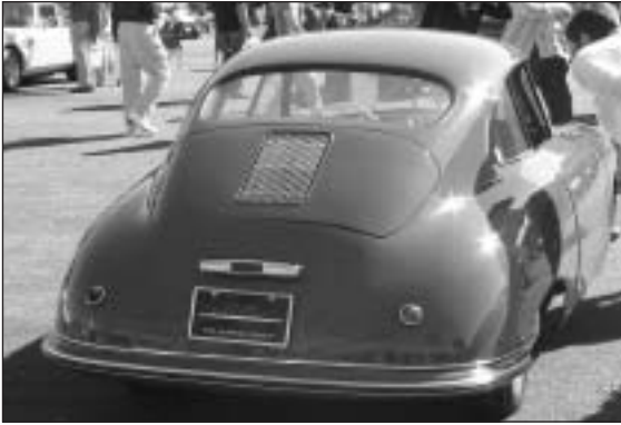
A very Porsche blue 356 in perfect condition!