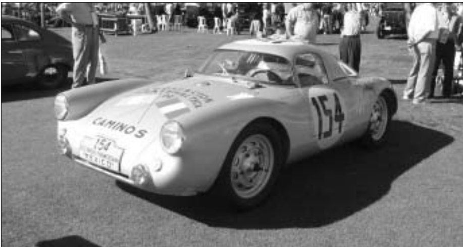
Best of Show at the Amelia Island Concours d'Elegance 1953 550 Spyder from the Collier Collection Naples, Florida