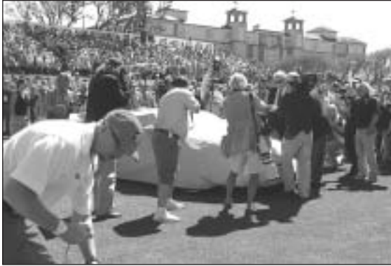
A GM concept car about to be revealed... You had to be there!